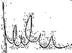
Nils Melzer Special Rapporteur on torture and other cruel, inhuman or degrading treatment or punishment