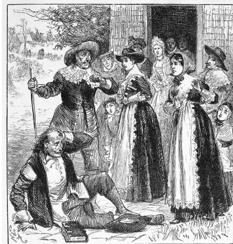
The Sheriff Resisted.